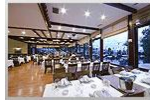
DEVELİ - Kalamış