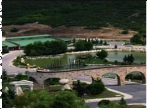
Yeditepe University Doğa Club