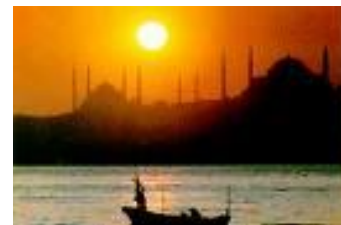
Sunset in Istanbul